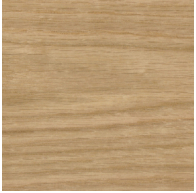
Oak Natural - OAK