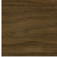
Walnut Natural - WAL